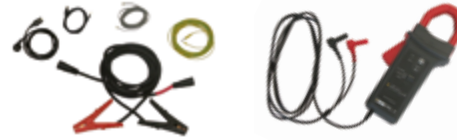
Testing cables and current clamp

Ranges: 40 A DC (10 mV/A) and 400 A DC (1 mV/A). Accuracy: 1.5% up to 40 A; 2% up to 400 A. Maximum conductor diameter: 30 mm.